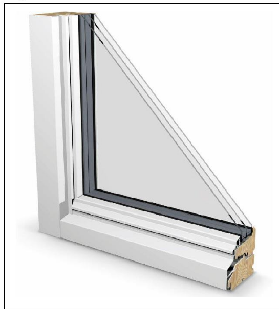
Figure 1 Corner detail

1.2 The windows comprise single tilt and turn inward opening windows (Juliet balcony door-sized windows), subject to the limitations shown in Table 1 and glazed with sealed, triple-glazed units (1) . The range is also available with multilight combinations, comprising fixed and opening lights.